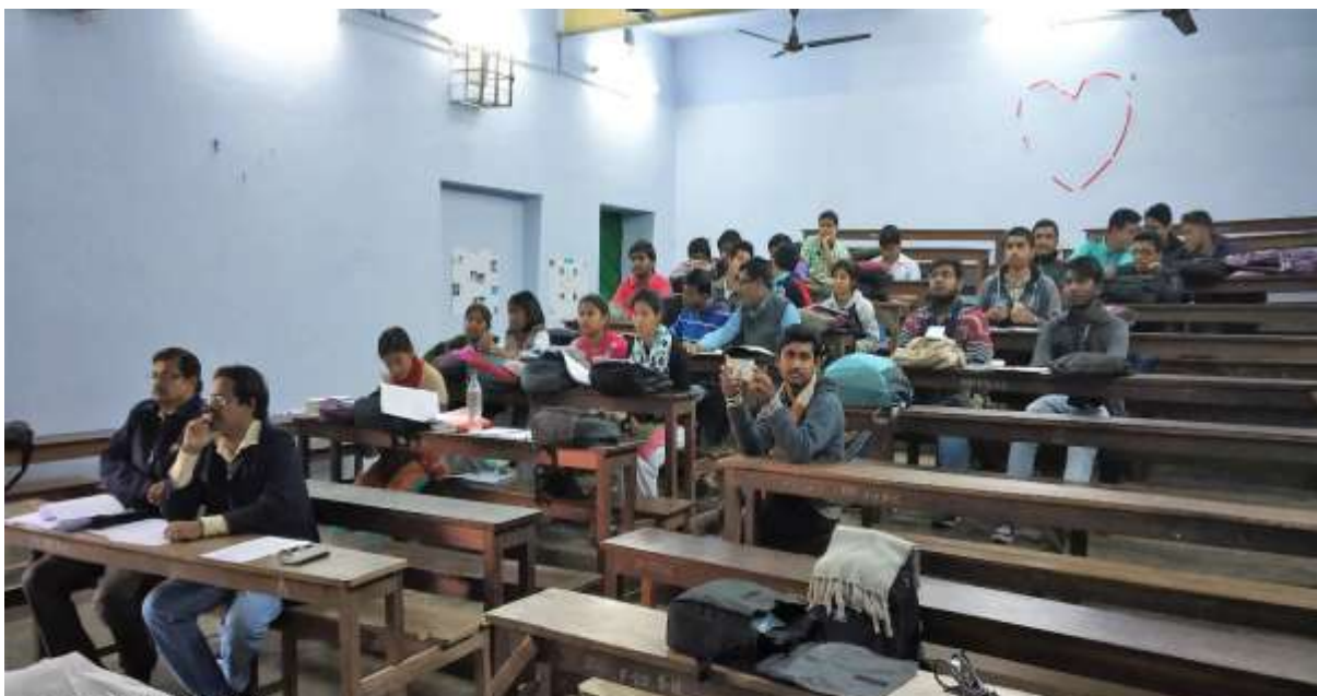
Some moments from the celebration of the National Mathematics Day on 22.12.2018